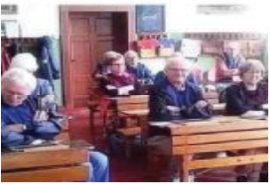
S.A.L.T. Senior Adults Learning Together